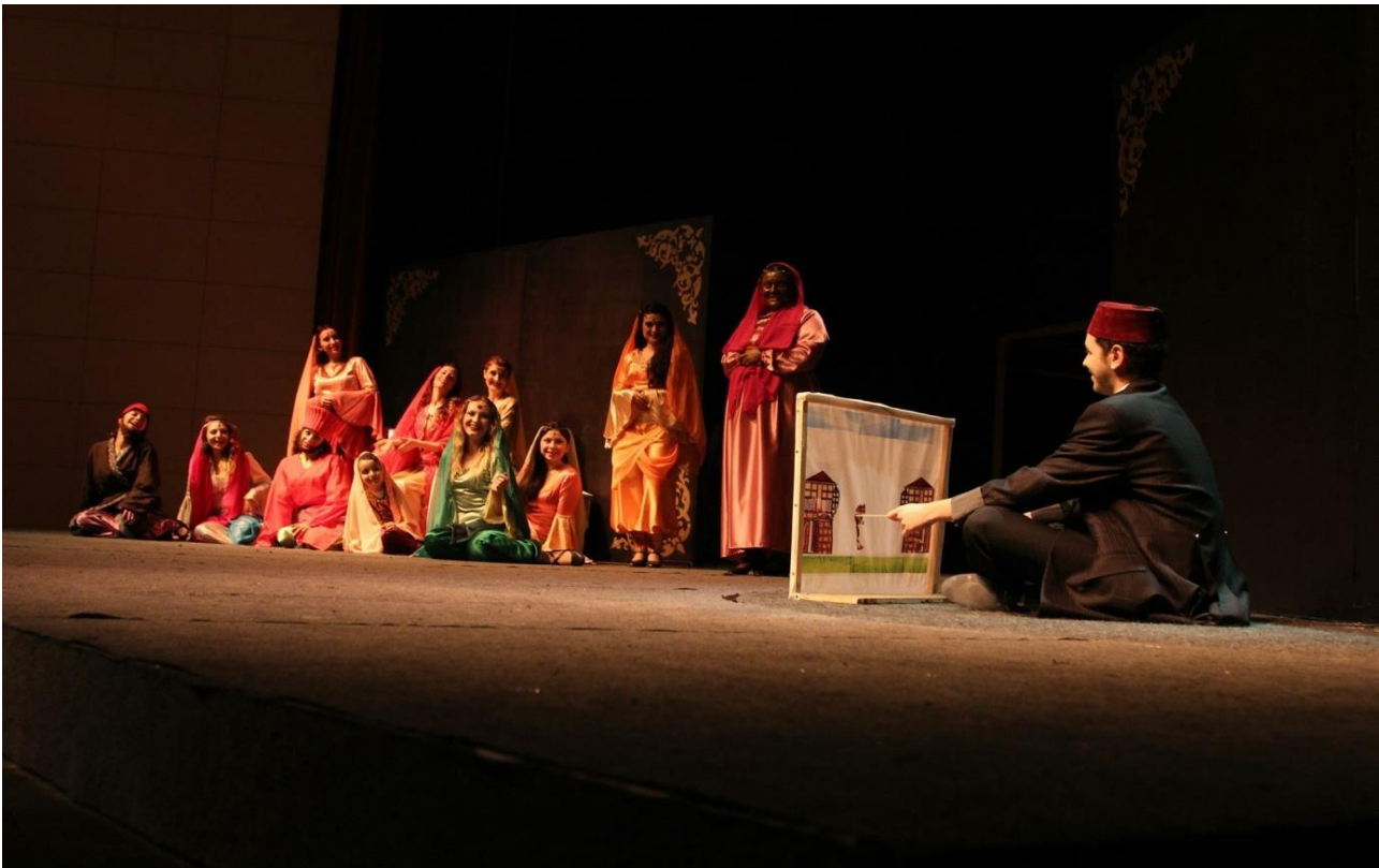
Image 1. Traditional shadow play, Karagöz and Hacivat, in the play.

In Fehim Paşa Konağı, Turgut Özakman and also the director uses Karagöz and Hacivat, traditional shadow plays, as play within play technique just to give Yusuf's chance to enter the mansion. It takes its name from its main characters, Karagöz. It was performed by a single puppet master, who voiced all of the characters, and accompanied by tambourine. It is said that the play came into Anatolia after Yavuz Sultan Selim, who had conquered Egypt in 1517, had brought the shadow play artists to his court. It is interesting to see that the playwright/director combine the modern play with the traditional Turkish drama and they want audience not to forget Turkish dramatic values.