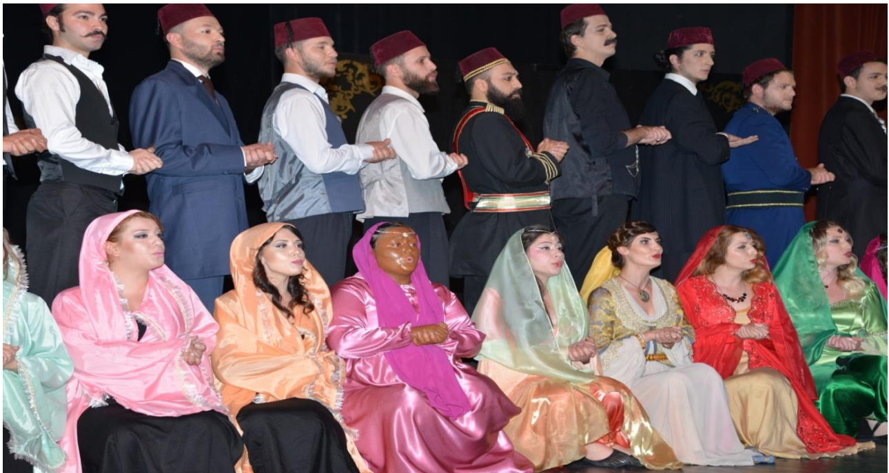
Image 7: The actresses and actors of the play with their costume and make-up

Costume is employed to index the dramatist personae in terms of character, self-image and self-presentation, and social and economic status. Costume is the first sign of audience to make connection between actor and his role. It gives the first impression about character's personality, social position, etc.